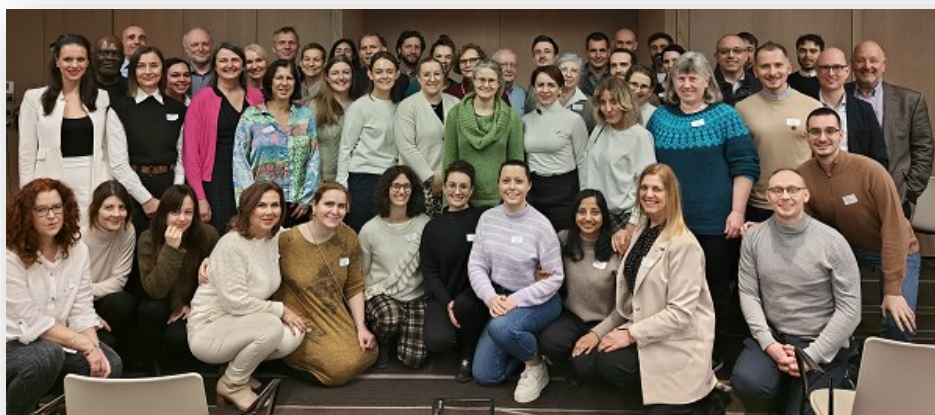
ECFS Patient Registry Steering Committee Meeting