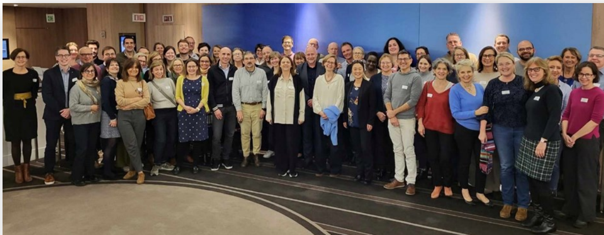
ECFS Clinical Trials Network Steering Committee Meeting

The ECFS Board, the ECFS Clinical Trials Network, the ECFS Patient Registry Steering Committees and the Standards of Care Group met in Brussels for their annual winter meetings at the end of January. This was an excellent opportunity to meet across ECFS projects, discuss common subjects, find new opportunities for co-operation, and catch up with colleagues.