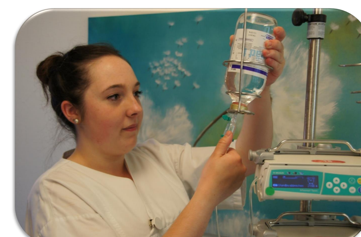
Inpatient intravenous antibiotic therapy