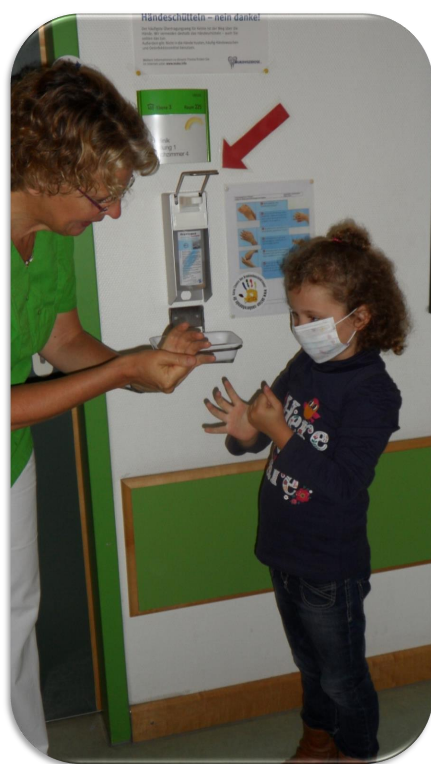
General information on hygienic practices