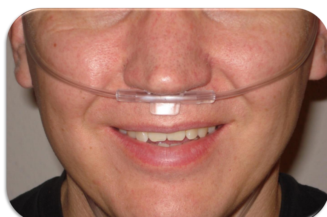
Long-term oxygen therapy