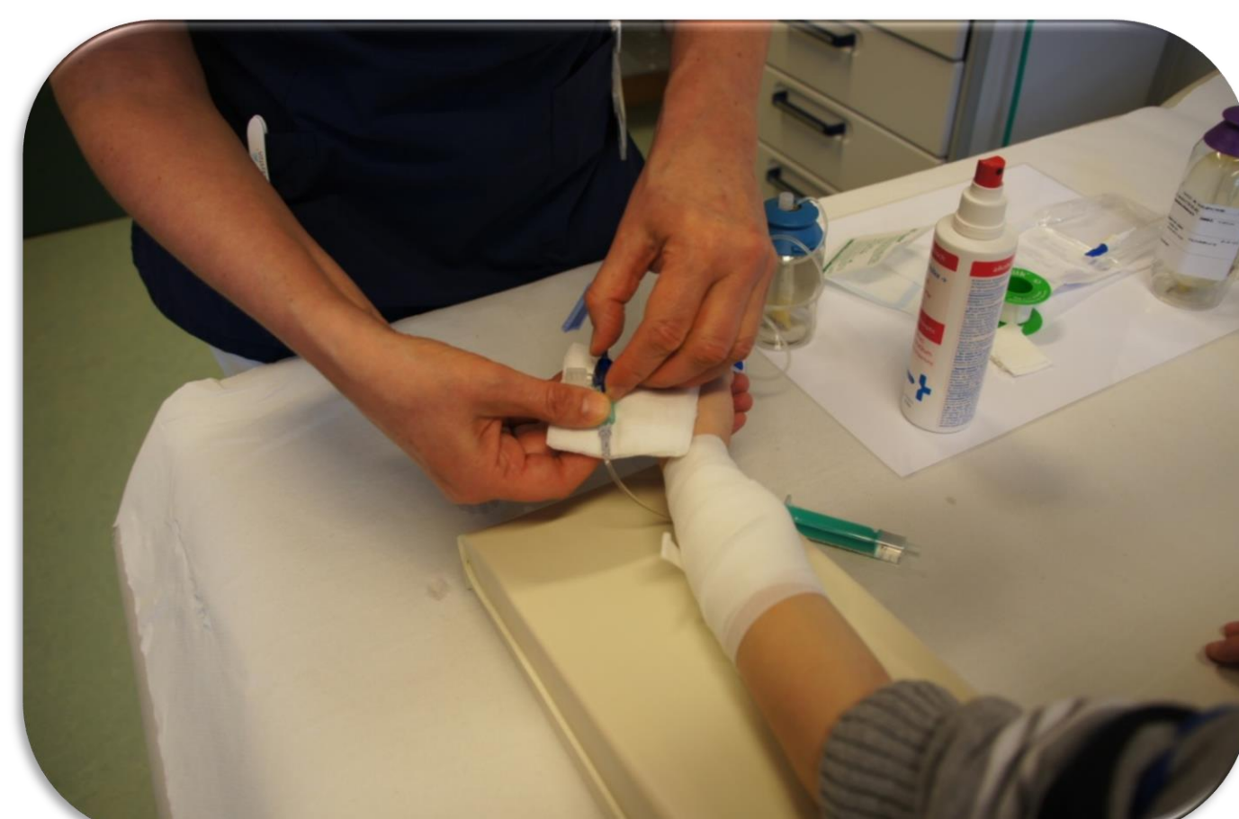
Outpatient intravenous antibiotic therapy