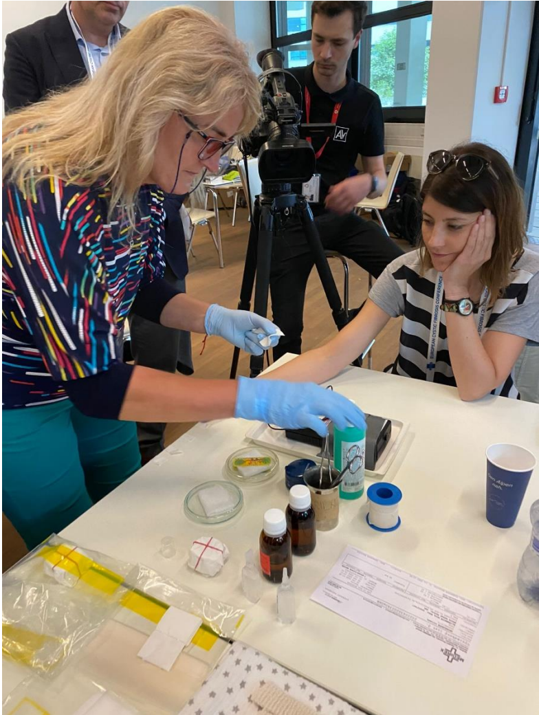
Gibson-Cooke sweat test method