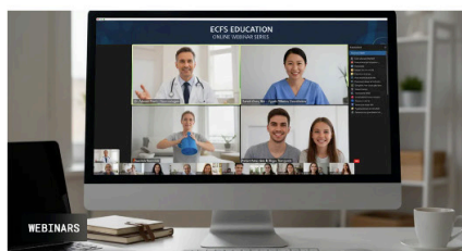
ECFS Education Webinars