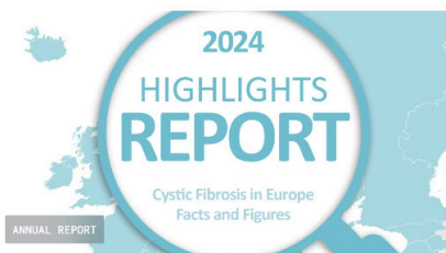
ECFS 2024 Data Highlights Report