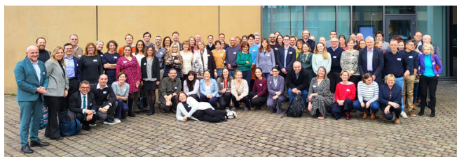
ECFS CTN Steering Committee

The ECFS Board, the ECFS Clinical Trials Network and the ECFS Patient Registry Steering Committees met in Brussels for their annual winter meetings at the end of January. This was an excellent opportunity to meet across ECFS projects, discuss common subjects, find new opportunities for co operation, and catch up with colleagues.