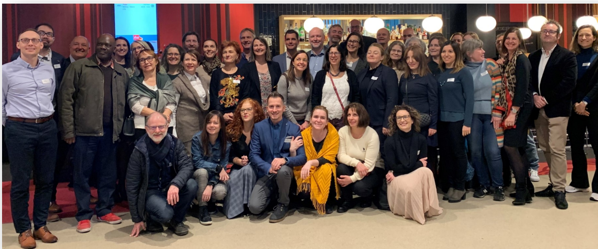
ECFS Patient Registry Steering Committee