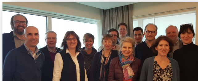
ECFS Board Meeting - Brussels, 22 January 2020