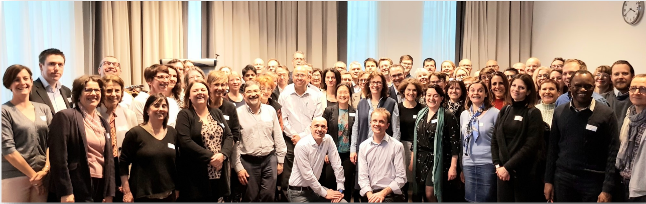
ECFS CTN Steering Committee

The ECFS Clinical Trials Network and the ECFS Patient Registry Steering Committees met on 23-24 January in Brussels for their annual winter meetings. The Standards of Care Group also met in Brussels. This was an excellent opportunity to meet across ECFS projects, discuss common subjects and find new and even better opportunities for cooperation