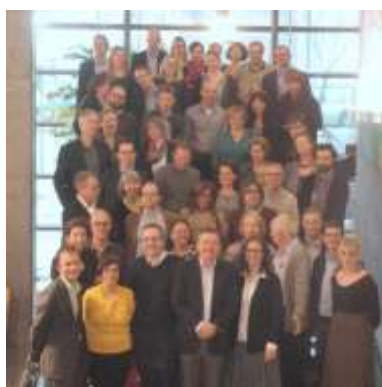
CTN Steering Committee Lisbon January 2017

The ECFS Clinical Trials Network and the ECFS Patient Registry Steering Committees met on 26-27 January in Lisbon for their annual winter meetings. The ECFS Standards of Care Group also organised meetings of some of its subgroups during these days. This was an excellent opportunity to meet across ECFS projects, discuss common subjects and find new and even better opportunities for cooperation.