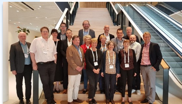
ECFS Board —June 2022